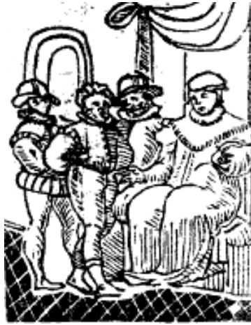
Figure 7. Stubbe Peeter at the Court (Enlarged)

He was brought to the magistrates (the one who was sitting under the curtains) after he was arrested. The scene was probably the court because it was well decorated with a curtain and marble on the floor. The judge was sitting on a chair which was covered by a piece of cloth. According to the text, he was brought to the local court in the town of Bedburg, 172 which also indicated that it was the court shown in Figure 7. These examples illustrate the features of the inquisitorial procedure.