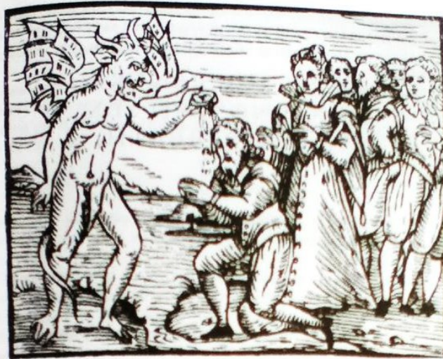
Figure 3. The Devil (left) baptizing his converts into the religion of their new master 50

From Figure 3, the man in the middle was kneeling in front of the Devil and being baptized. It could be seen as a reverse practice to the baptizing in the Catholic Church. We can see from this picture that these men and women turned to Satan to be his slaves. Figure 3 shows how the witches and sorcerers were baptized by Satan, which is also related to the pact between werewolves and Satan stated above. Doing homage to Satan, they would do all evil things, such as killing children or causing hailstorm to destroy crops, at his commands. In the werewolf cases, they were said to have received the tools for the metamorphosis to kill young children.