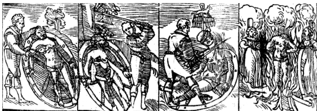
Figure 8. Burning of Stubbe Peeter, Stubbe Beell and Katherine Trompin (Englarged)

The trial of Stubbe Peeter ended with the vivid description of the scene. In spite of the limitation of length, the punishment was written in detail in the last few pages of A True Discourse and drawn lively on the cover (see Figure 8).