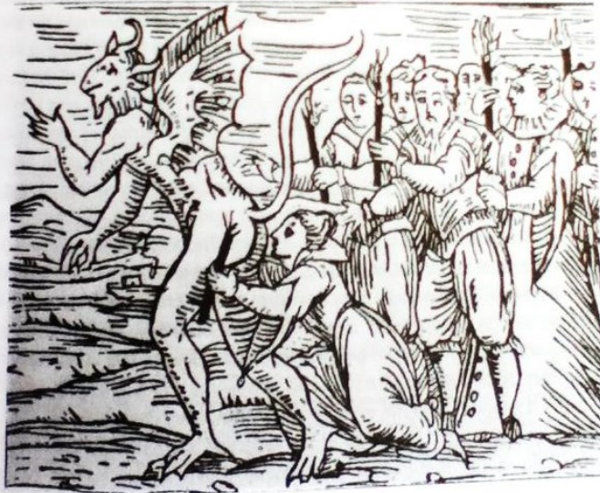
Figure 4. Witches at sabbat 63

The witch in the middle was portrayed to be kissing the buttocks of the Devil, which was a ceremony reiterated in the learnt men's concepts of the sabbat. It was one of the damnable things condemned in the learnt circle since the witches were believed to have done homage to the Devil but renounced God and the Catholic religion. Although the attendance to sabbat was not mentioned in detail in the trials, Figure 4 thus helps us to visualise what had happened at sabbats. We then understand why werewolves were condemned to be sorcerers.