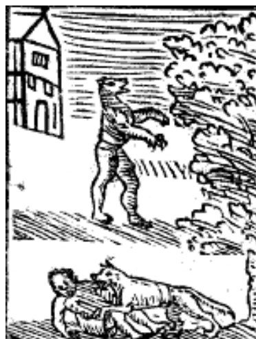
Figure 5. Stubbe Peeter as a werewolf (enlarged)

The image of werewolf is seldom found in painting or wood-cut illustration. Among these five cases, only the cover (Fig. 1) of A True Discourse could be found and showed the trial of Stubbe Peeter. The wood-cut illustration presented the image of werewolf and how it killed people. Perhaps it was an effective way to raise the awareness of the illiterates towards werewolves. Here, the highlights of Figure 2 give us the image of how a werewolf depicted in the early period.